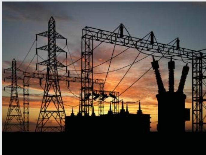
Power generation and transformers

Available with the S8000 Integrale is a viewing microscope. This enables the user to inspect the mirror surface during the measurement process enhancing confidence in the measurement accuracy and the formation of the correct phase of water condensate (dew or frost) on the mirror surface.